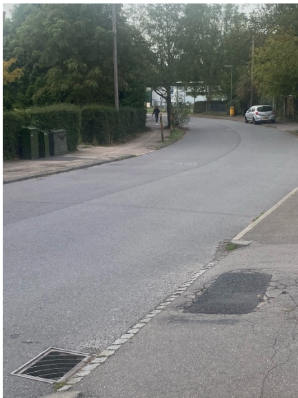
Access via Weldon Way, on street parking