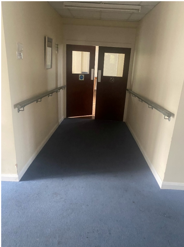
Entrance to the Community Room from the hallway, gentle slope with handrails