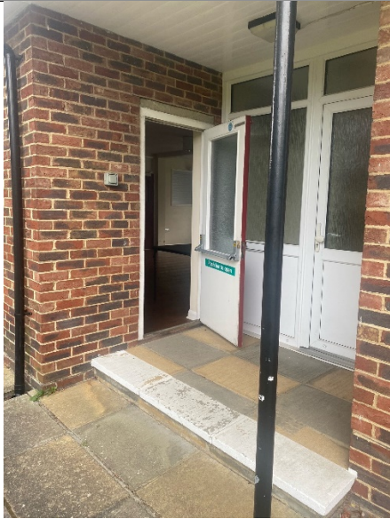
Emergency exit door & path. One shallow step