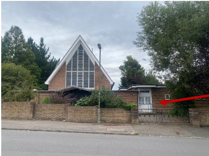
The Community Room entrance