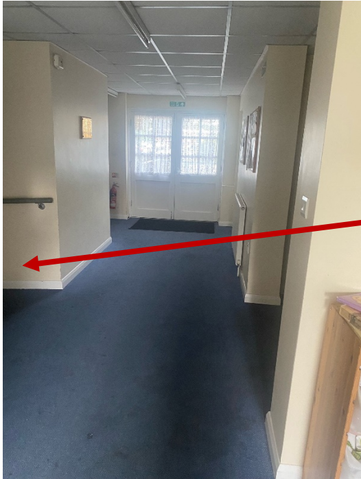
Front Door – internal view