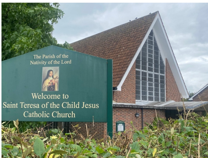
The church building & signage on corner of Weldon Way & Worsted Green